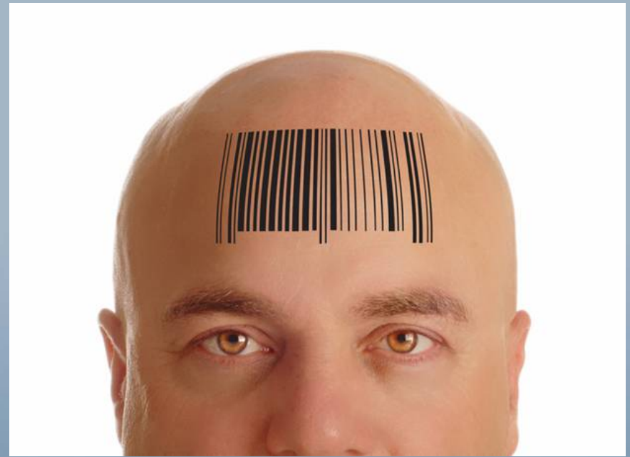
After completing my first week in local government service