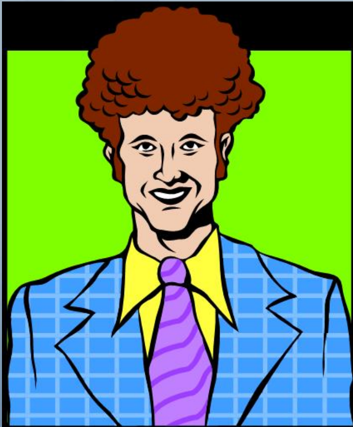
First day on the job in local government - 1989